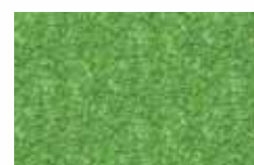
3104-G1 ¾ yard