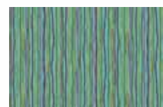
5289-R ¾ yard