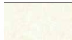
3135-L2 1½ yards