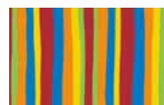
5309-B ¾ yard