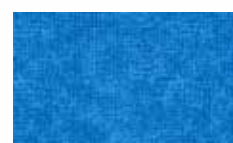
3135-B2 ¾ yard