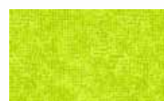
3135-G2 ¾ yard