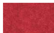
3135-R2 ¾ yard