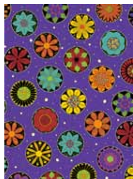
5349-P 1¾ yards