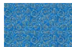
5287-B ¾ yard (extra yardage needed for backing)