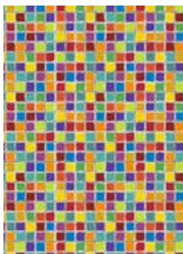
5286-T ¾ yard