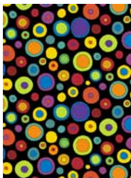
5285-B ¾ yard